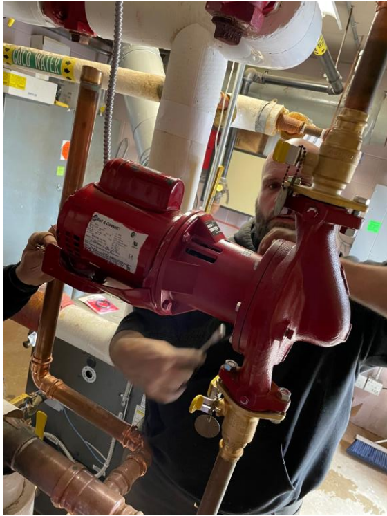
Circulator pump install at the Field House