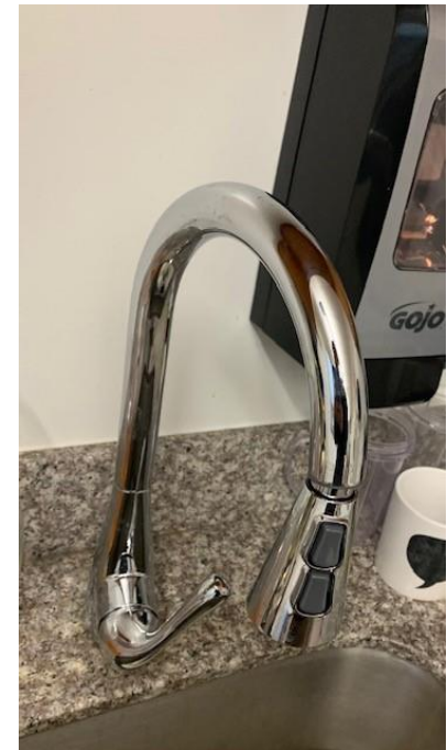
Faucet install at East Elementary